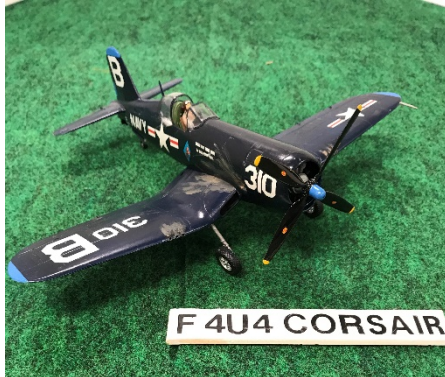
F 4U4 CORSAIR