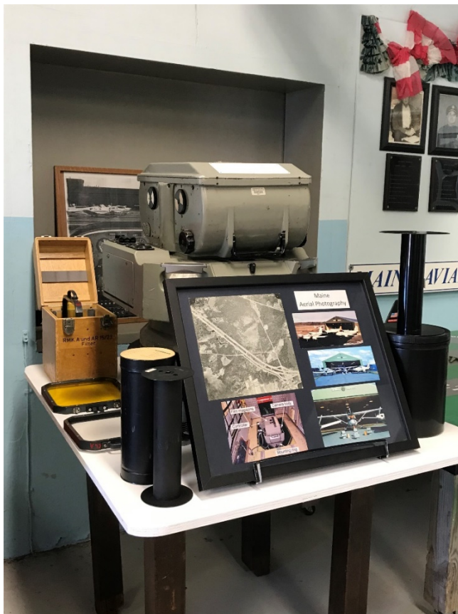
Aerial camera system displayed with accessories and a sample photo, taken by James Sewall Co., with this or similar equipment

This summer has been a busy one at the museum. Several new, exciting displays have been added thanks to donations by MAHS members and other generous Maine citizens. This edition of the Dirigo Flyer will introduce the new displays to you, and hopefully entice you to visit the museum to see the displays in person.