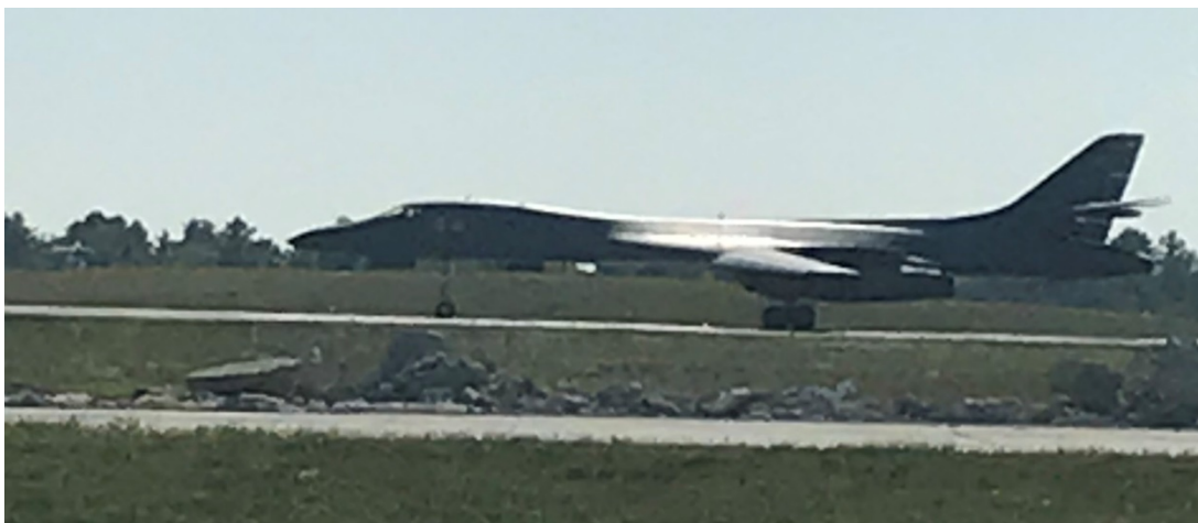
USAF B-1 bomber taxiing on the runway behind the MAM. September 1, 2018